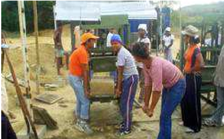
Making the Blocks for the Houses