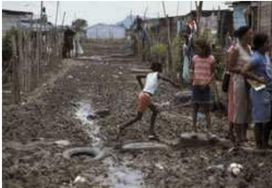
Cartagena-not the tourist part